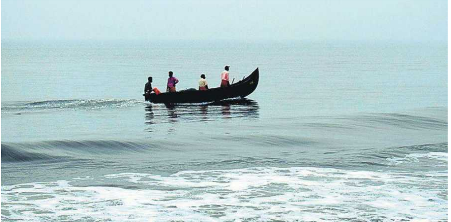
Fishermen at Cherai beach